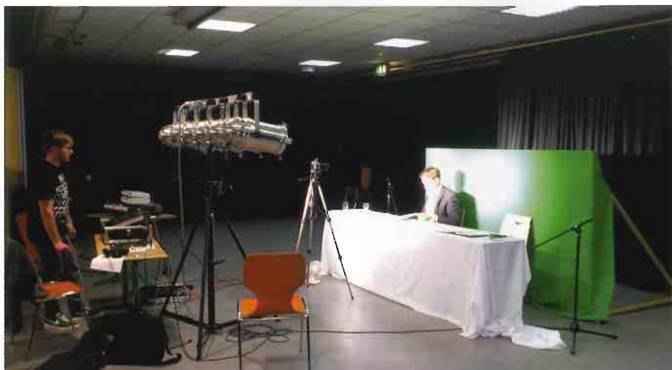
Shooting of the video clip "The lie of Douaumont"