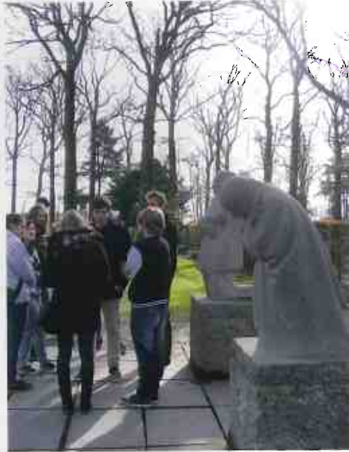
German military cemetery at Vladslo with the "Mourning Parents"

But there was very nice weather, and so the students could finish the excursion with a walk along the beach. Meanwhile, there is a new museum around the King Albert Memorial in Nieuwport and the Ganzepoot, the system of watergates, is also open for visitors.