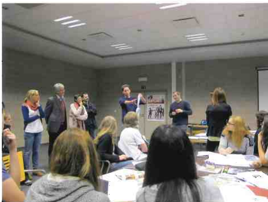
Working session at Peace Village in the evening

During the project meeting at Zollverein Colliery in Essen in June 2013, the idea was born to organise an excursion to one of the theatres of war in the memorial year of 2014. GrenzGeschichte DG proposed a visit of the battlefields of Flanders. Here a small part of Belgium had remained unoccupied in 1914 and from here the liberation of the country initiated. During the different campaigns that cost the lives of hundreds of thousands of people, the region was ploughed up and cities like Diksmuide and Ieper (Ypres) were smashed to the ground. Even today ammunition is found regularly and people die in explosions.