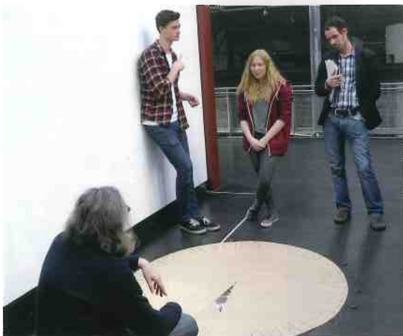
Students, teacher and scholar discussing, Oberhausen

At the beginning of the project, one first had to adapt the way of communication. The school, the teachers and students speak a different language than the museum staff. The participants had to agree on the content and the aims of the project and to define a schedule. It proved beneficial that the students were involved in every stage of the work.