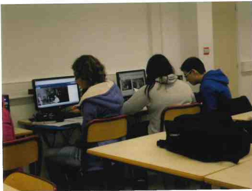
Working Session at school, Le Creusot

Our contribution to the virtual exhibition deals with "Aspects of work during the First World War". The most difficult work was the creation of the slides with "Creaza" as well as the translation of our texts into English. We wanted to show aspects of the economy and the work during the war at Le Creusot in France and in Germany