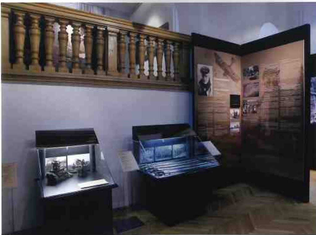
Exhibition in the Muzeum Śląskie, Katowice

We have shown the war from the front and from the back. The protagonists of the exhibition were Silesians from different social backgrounds who represent different national identities. They had one thing in common – they all went through the traumatic experience of total war. Apart from the trenches and the development of military technology, we reconstructed