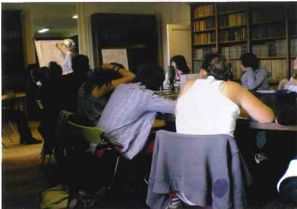
Working session at the museum, Le Creusot

Difficulties arised from our English language abilities and our lack of experience in the use of the learning management system Fronter. So, it was rather difficult to share ideas and information with our partners. In addition, the connection to Creaza by Fronter was technically difficult. But the use of this software allowed students to work in another „world“: the animation possibilities allowed them to think about war with a distance and gave them some freedom of imagination.