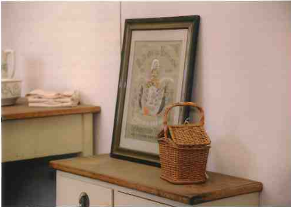
Shooting of the 3-D-Tour through a worker's kitchen