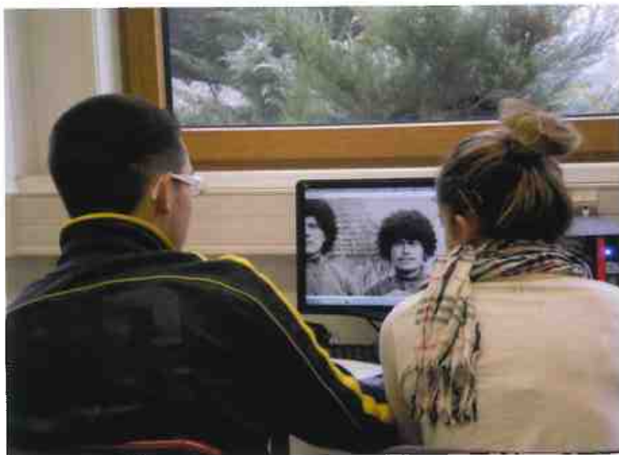
Students working with Fronter, Le Creusot

The implementation of Fronter for the project "Searching for Traces of 1914" was a special challenge. While schools usually work quite self-sustaining in daily routine, for this project international cooperation was realized with Fronter for the first time.