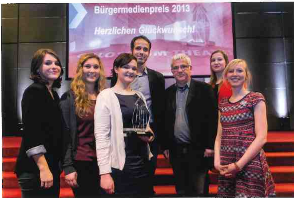
Bürgermedienpreis – Award Ceremony in Essen, December 6th 2013