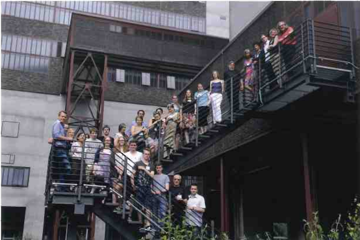
Project Meeting at Zollverein Colliery, Essen, February 5th 2013

Topics ranged from the effects on family life like loss of a relative and female labour in the industry, to the consequences of war such as occupation and the shifting of borders in the wake of peace treaties. To make the results of their research public, the students developed diverse creative forms of presentation for the virtual exhibition. It includes video clips, slideshows, interviews of witnesses, comics and sound stories.