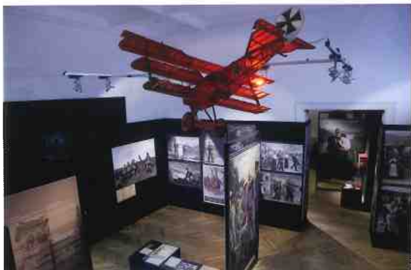
Exhibition in the Muzeum Śląskie, Katowice

Moreover, we could participate in workshops on computer graphics and visit other exhibitions that inspired us to create our own one. We could also participate in the conference at which we learned about the history of World War I from a point of view which we did not know from the history lessons at school. As a result, we acquainted ourselves with the everyday life of people living at the time. Furthermore, we had the opportunity to go to Oberhausen, Essen and Flanders where we met all participants of the project "Traces of 1914" and presented a video showing the results of our two years lasting work.