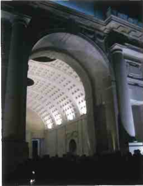
The Menentor in Ypres during the "The last Post" ceremony

Dodengang. This preserved part of a Belgian trench at the river Ijser was closed for restoring. But because of connections to the department of history of the Belgian armed forces, a visitation was made possible. In Nieuwport construction works were taking place, too. So, we were not able to see the watergates of the Ijser, which had been opened by a Belgian on 28th October 1914 to stop the German invasion.