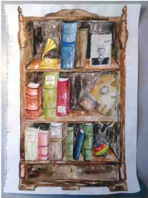
Concept of the frontpage of the virtual exhibition

The creative reappraisal of the relics of life in 1914 was realized in different ways in every country. Photos, films or sound-stories with objects like field-postcards, toys or gas masks to illustrate life both at the front and at home