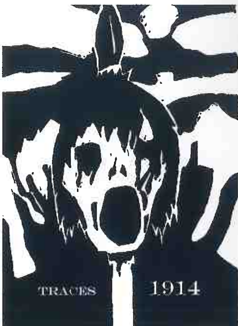
Poster of the play "Traces 1914"

The LVR-Industriemuseum Gesenkschmiede Hendrichs cooperated with the long-standing partner school, the Humboldt-Gymnasium Solingen. The school wanted to give many students the opportunity to deal with the issue of World War I. As a result, groups of students from different classes and grades worked on very different subjects: These ranged from the study of the production of poison gas in chemistry class, war sermons in religious education, public buildings during World War I. in Solingen in art class up to historical topics such as female labour in Solingen in history lessons.