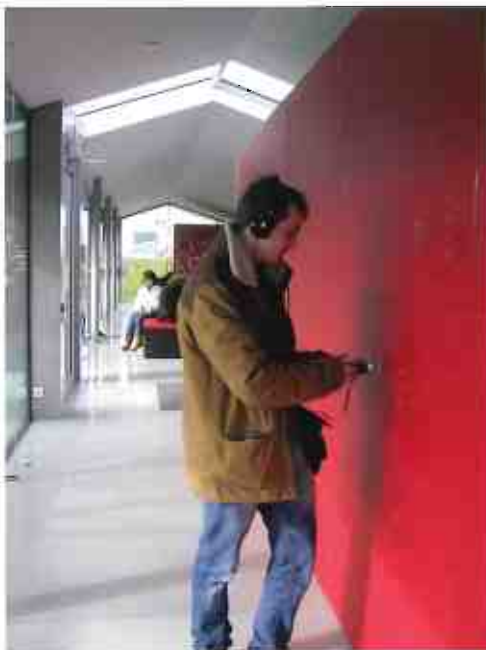
Recording in the Visitor Centre of Lijssenthoek Military Cemetery

With fast and spasmodic images, with continuous movements within the different places, I intended to recall the sight the soldiers had on the battlefield. The way they were moving forward in order not to get plugged by a bullet, the way they were crawling, the way they were going through the hoses of death. On the contrary, during the interviews, I wanted to set up the peace by returning to fixed shots to let the viewer be able to concentrate and read their feelings in the eyes of the students.