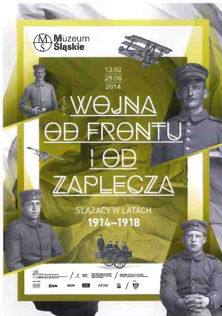
Exhibition poster of the Muzeum Śląskie

Students acquired knowledge through workshops and research excursions organized and conducted by the employees of the Muzeum Śląskie. The student group visited the State Archives in Pszczyna and towns associated with the life of Manfred von Richthofen (Wrocław, Swidnica, Ostrow Wielkopolski). Furthermore, they attended twelve workshops about history, history of art, ethnography, exhibition design and applied graphics.