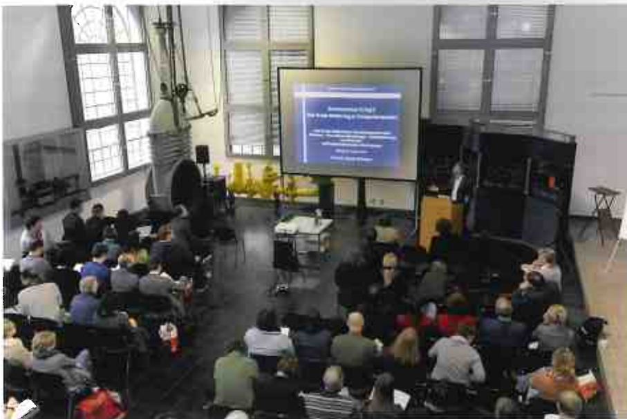
Teacher training, Oberhausen

World War I is an integral part of history education. The educational objectives, however, have been changing over the years from a content-based perspective that focuses mainly on a history of events to approaches that intend to carve out the personal, often painful experiences of people affected by the war, as well as its inhuman nature. Inspired by recent developments within the field of cultural history, such a perspective allows for a variety of new accesses to the topic and provides new ways of dealing with past events and their protagonists.