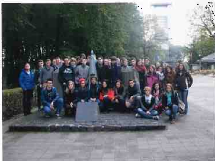
Excursion to the border triangle, October 9th 2012