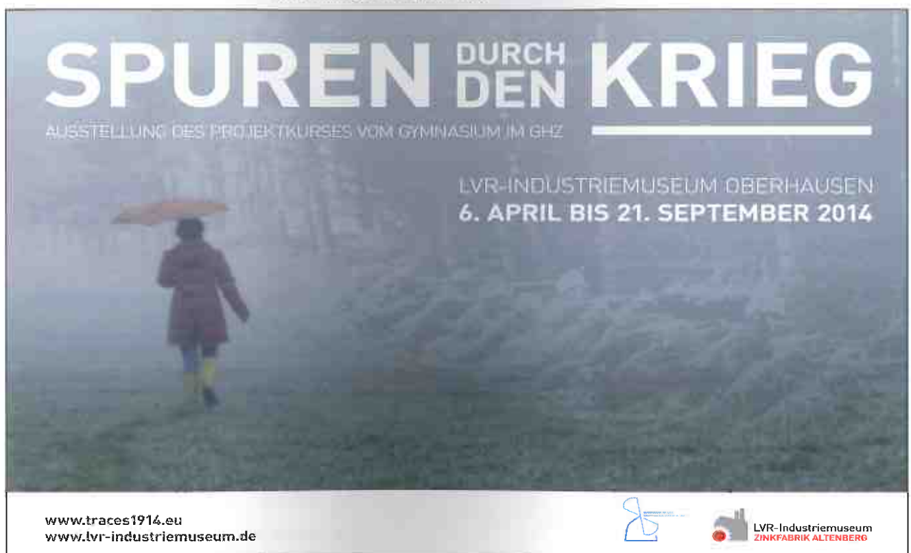
Poster of the exhibition "Spuren durch den Krieg"