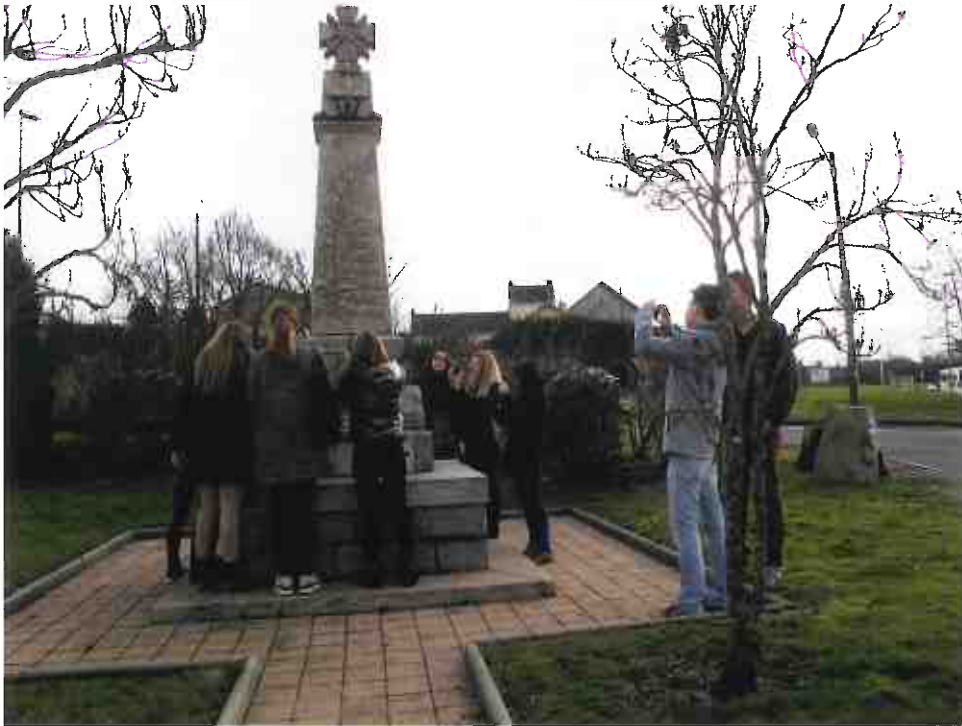
Students in front of a war memorial near Le-Creusot

The quality of the organisation for the virtual exhibition, all the meetings, the stay at Ypres and the freedom given to each museum to act according to its requirements are very positive points. The trust and shared dialogue that were established at various meetings were a major element in the success of the partnership. We appreciated the commitment of everyone and the quality of relationships that were developed throughout the project.